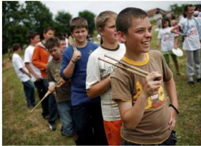
Participants of the Festival Day performance