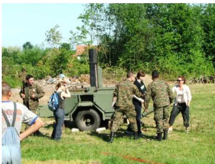
Field kitchen provide by the BiH Armed Forces for the use by volunteers

Dealings with officials and authorities are time consuming and require language skills and a good understanding of the system. These tasks consumed most of the bilingual volunteers' time on this occasion.