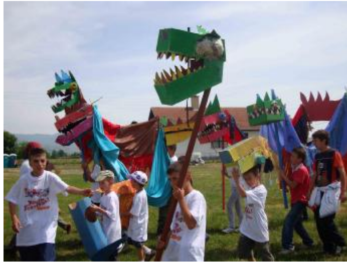
Puppets workshop rehearsal for the Festival day