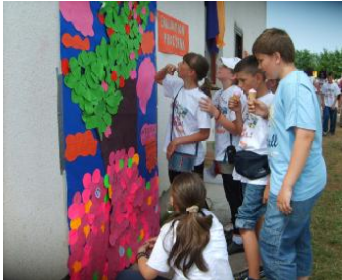
The final evaluation tree as it was erected on the wall of the Community Centre

On the other hand it did not allow in-depth responses and probing. In terms of analysis, this was a challenge as the children interpreted each activity in different ways and did not stick to the specific question asked. In the leaves exercise for example many participants chose to reflect on how they were feeling about the activities thus far rather than on challenges. However, this constitutes an inevitable aspect of evaluation work with young people where creativity and individual choice are the governing principles.