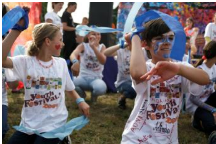
Dance performance on the Festival Day

“During this week I’ve learnt how children can play together and sing.”