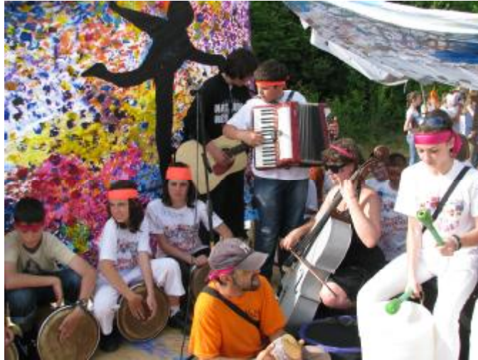
Music Workshop Festival day Performance

“The challenge was to act everything properly and we achieved that. This was a great experience that will be useful in the future.”