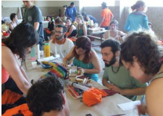
Volunteers preparing for workshops