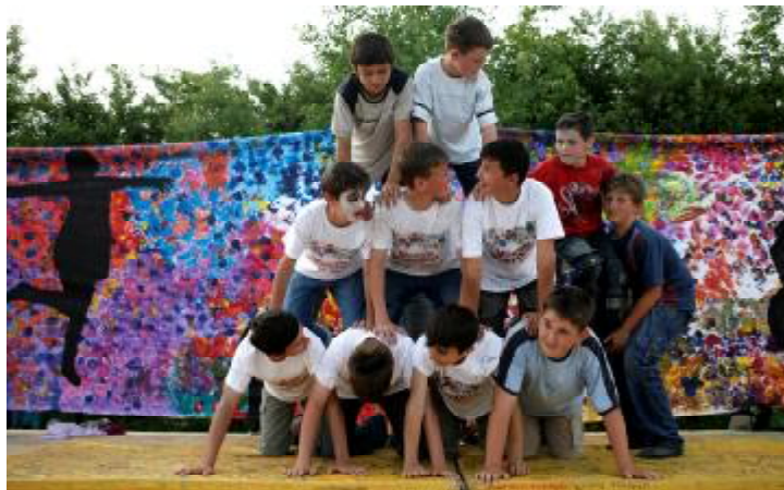
Children participate in circus skills performance

“The kids learnt so much that will stay with them forever from circus skills to painting a backdrop, stage or a painting. They learnt many skills that will be very useful for them” (Transcript 8, quotation 84, Teacher).