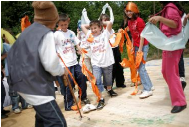
Drama Performance on the Festival Day