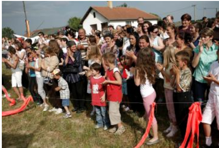
Audience on the Festival Day

Although limited and somewhat cautious publicity, it still generated lots of interest. All reports and interviews closely kept to the press release and were extremely positive. In the 6 days of the Festival, there were five live radio interviews with Federal Radio in Sarajevo, Radio Bosnia and Herzegovina in Sarajevo and radio Republika Srpska from Banja Luka. Three TV reports were broadcast on two local TV stations in Prijedor and two were broadcast on the national TV of Bosnia and Herzegovina.