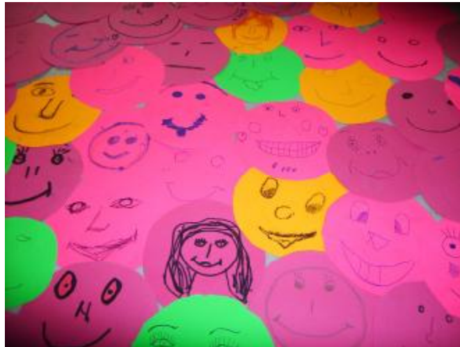
A cluster of evaluation faces drawn by workshop participants reflecting responses to the 'Festival experience' on day two

The content and methodology of the evaluation sought to facilitate creative collaboration amongst children and between children and volunteers and to encourage the participatory approach which underpins Most Mira's work.