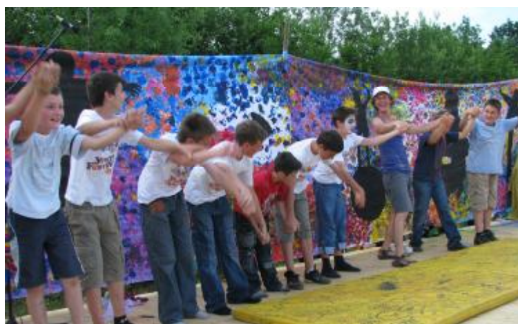
Circus Skills performers take a bow

The UK media were not brought in, but Most Mira is preparing a photographic exhibition and a short video about the Festival.