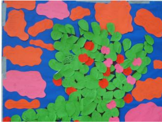
Leaves (challenges), fruits (personal changes and gains) and clouds (suggestions) attached to the evaluation tree.

As presented so far, extensive feedback largely refers to the positive outcomes described most emphatically by the children themselves. However, the workshops also triggered a range of more difficult experiences. Data about this was gathered when workshop facilitators asked the children to note anything they had found challenging on or before the fourth day. The photograph below shows a group of these 'challenge' leaves – the format in which this evidence was collected.